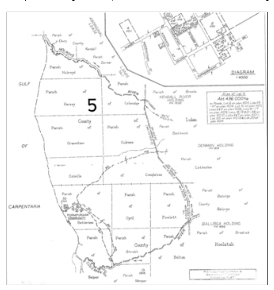
Figure 2: Lot on Plan (composite image) depicting boundaries and community areas within the Pormpuraaw Aboriginal Shire

The Council is a key employer within the Pormpuraaw region (57.8% of the Shire population indicated they were employed by local government in the 2006 census: ABS). Some 45% of Pormpuraaw Shire residents are employed full time, with 36.4% employed on a part-time basis, and there is an attributed unemployment rate of 5.5% (2006 census: ABS). A 2006 census derived demographic profile of the Shire indicates 68.8% of the population is aged 15 to 64 years, 27% aged 0 - 14 and 3.8% aged 65 years and over.